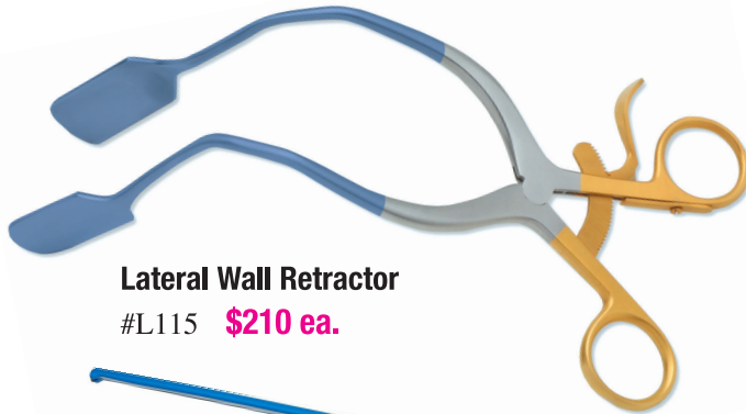
Lateral Wall Retractor #L115 $210 ea.