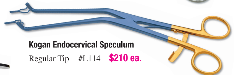
Kogan Endocervical Speculum Regular Tip #L114 $210 ea.