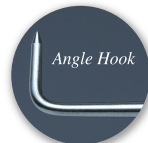
#C107 $75 ea.