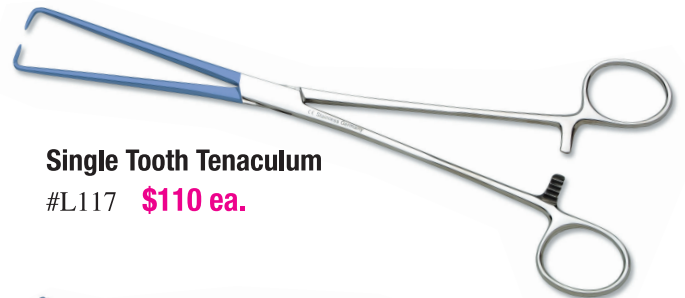
Single Tooth Tenaculum #L117 $110 ea.