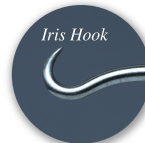
#C109 $75 ea.